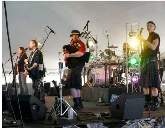
Mother Grove... live performance, 2010