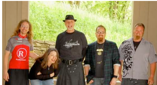
Mother Grove... experience "Kilt Rock" in Scotland!