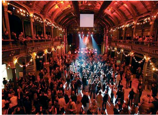
Amazing music... brilliant venues

While on the trip, keep eyes and ears opening for connections to The Bard. And, who knows? We might even encounter the man ourselves!