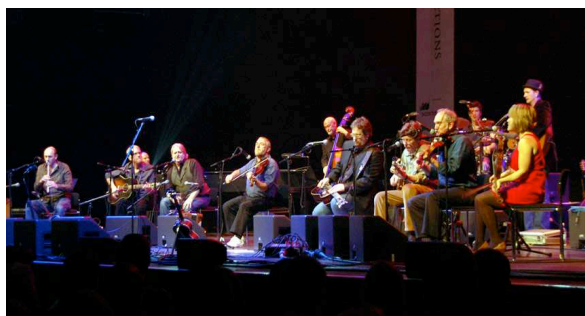
Transatlantic Sessions group jam, 2010

Come join us for 11 days/10 nights of revelry and learning. Nights will be for music, days for historical immersion and sightseeing in/around Glasgow and its environs.